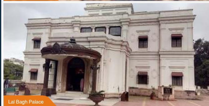
Lal Bagh Palace